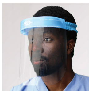
FM89030 Face Shield, XL Length, Foam Top, Elastic Headband