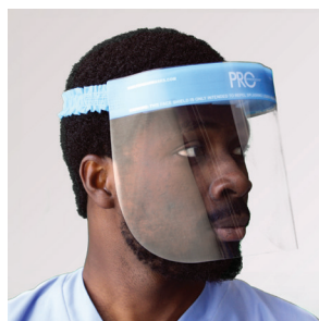
FM89010 Face Shield, Full Length, Foam Top, Elastic Headband