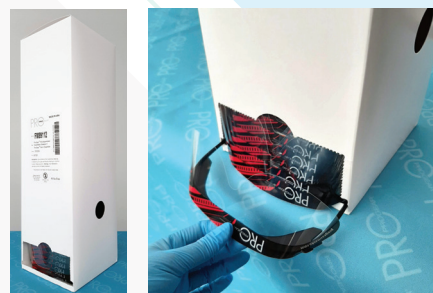
FM89112 NEW! Pre-Assembled Disposable Glasses, ProGear Pack Dispenser

160 glasses per case Packed in 4 dispensers of 40 each