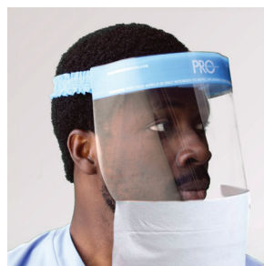
FM89012 Face Shield, Full Length, 11" Drape, Foam Top, Elastic Headband