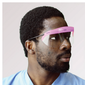
FM89111 Pre-Assembled Disposable Glasses, Pink

100 glasses per case Packed in 10 bags of 10 each