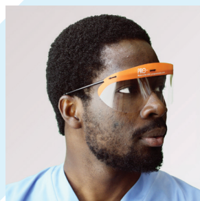
FM89110 Pre-Assembled Disposable Glasses, Assorted Colors

100 glasses per case Packed in 10 bags of 10 each