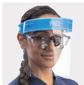
FM89011 Face Shield, Full Length, Loupes Headlight Cut-Out, Foam Top, Elastic Headband