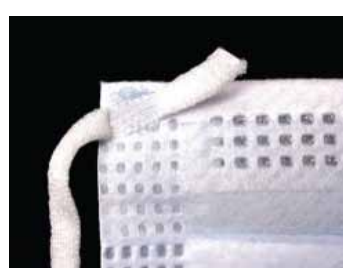
OUR COMPETITION'S TABBED EAR-LOOP MASK

P: (817) 427-2700 | F: (817) 886-2733 www.progearmasks.com